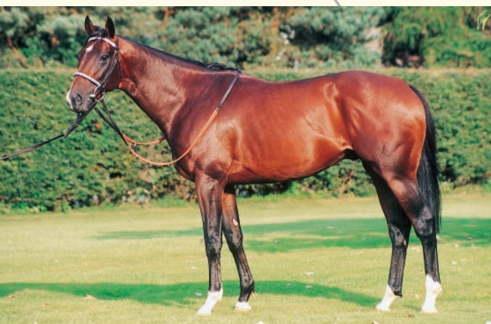
MUGHARREB AS A THREE YEAR OLD